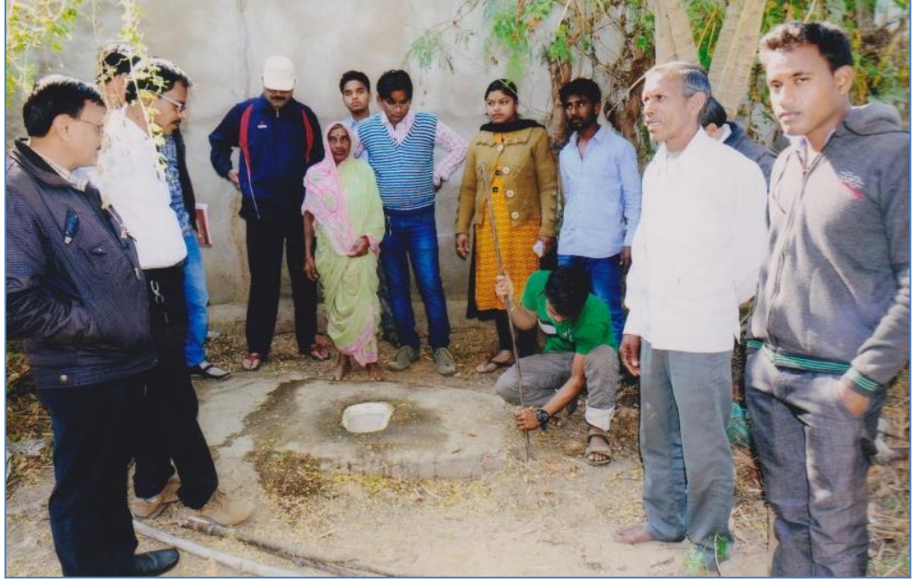
NSS Valunteers constructing toilet in NSS during camp