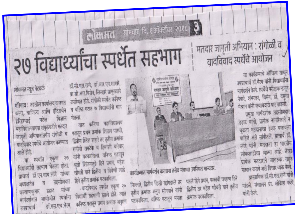
A news was published in Lokmat