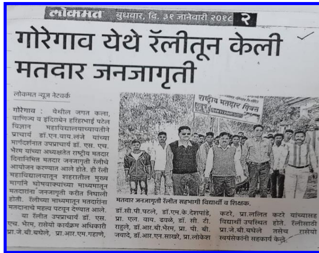
A news was published in Lokmat