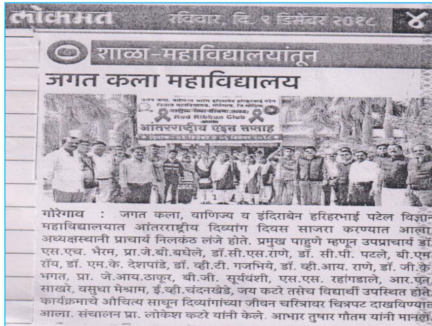
News was published in Lokmat on dated 09/12/2018