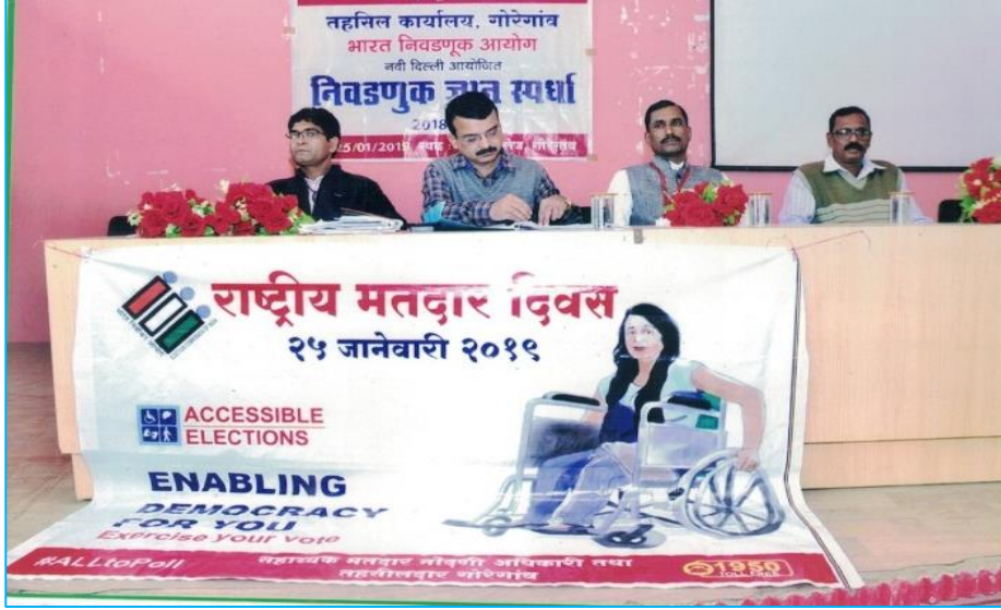
Dignitaries on the dais for voter awareness program