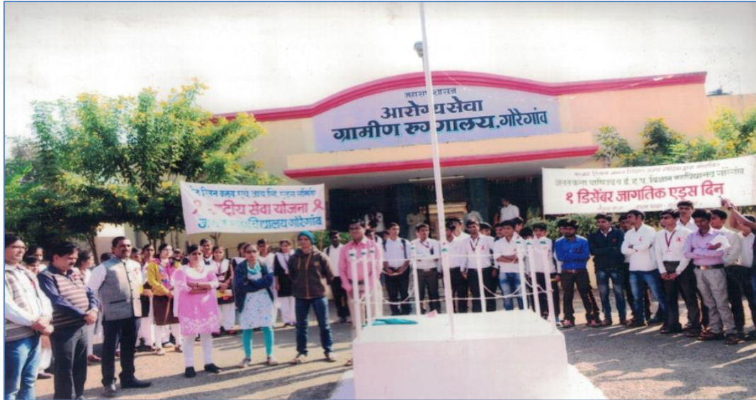
Principal, Faculty members and Students during AIDS Awareness Rally in Rural Hospital Goregaon