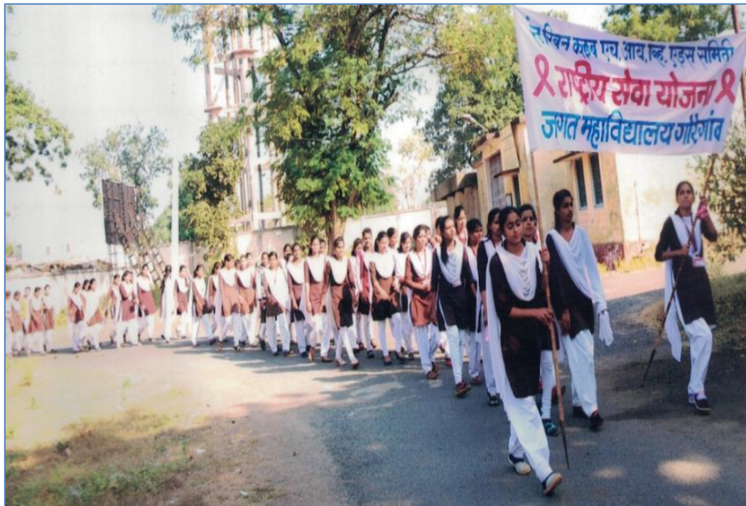
Students participating in AIDS awareness rally